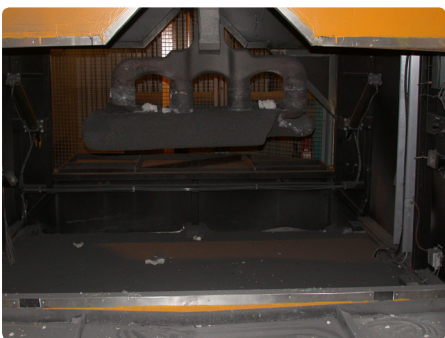
Butt ready to be measured.

Based on these measurements the butt volume and weight is calculated.