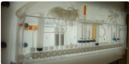
Assembly Verification in the Pharmaceutical industry

Scorpion Basic™ is used in 2D and 3D assembly verification. The combination of multiple cameras, color processing, unique reference systems, high accuracy and 3D makes it well suited for the automotive and pharmaceutical industries.