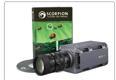
The Scorpion Basic combined with a SmartCam gives you a compact and cost-effective solution. Ideal for high precision gauging and 2D and 3D Robot Vision.

The Scorpion Basic™ version supports the Windows XP operating system and SmartCameras from Sony. These cameras are well suited for 2D and 3D Robot Vision.