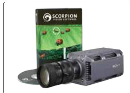
The Scorpion Basic combined with a SmartCam gives you a compact and cost-effective solution. Ideal for high precision gauging and 2D and 3D Robot Vision.

The Scorpion Basic™ version supports the Windows XPe operating system and SmartCameras from Sony. These cameras are well suited for 2D and 3D Robot Vision.