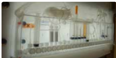
Assembly Verification in the Pharmaceutical industry

Scorpion Basic™ is used in 2D and 3D assembly verification. The combination of multiple cameras, color processing, unique reference systems, high accuracy and 3D makes it well suited for the automotive and pharmaceutical industries.