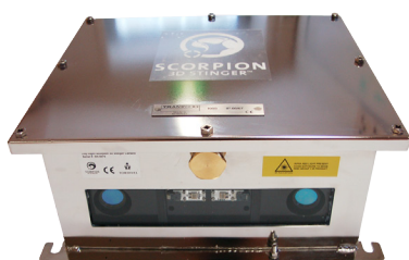
Day Night Scorpion 3D Stinger™ Camera