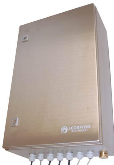
Scorpion Stinger™ System Cabinet

The unit has space for adding other system functions needed in an application.